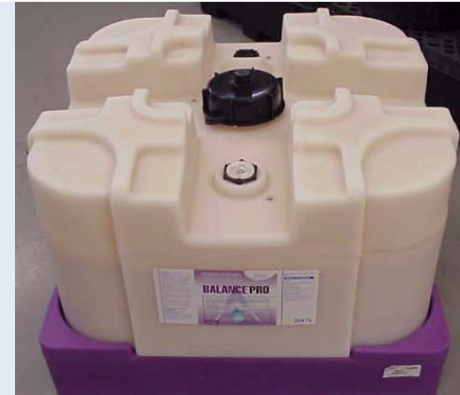
Roto Mold "Asset" IBC